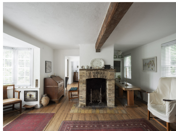
Kettle's Yard.