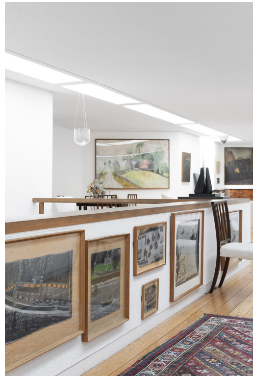
Kettle's Yard.