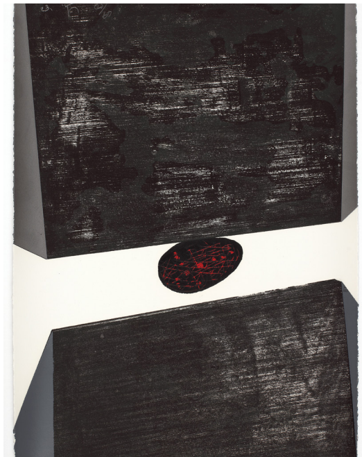
Kenji Umeda, Cantos - 1 , 1982.