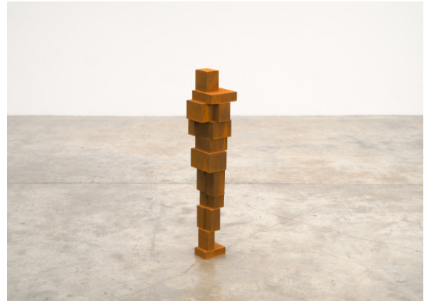
Antony Gormley, Small Still II, (2025). Cast iron. 92.5x18x18cm.