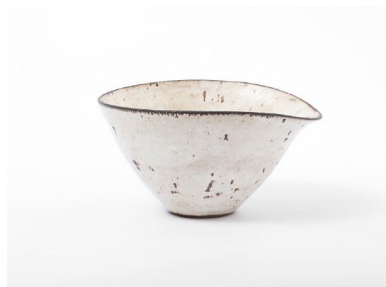
Lucie Rie (b. 1902, Vienna), Bowl. Date unknown.