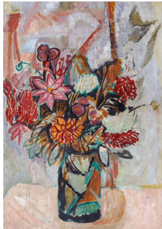
Vanessa Bell, Still-life of Dahlias, Chrysanthemums and Begonias (1912). Oil on canvas.