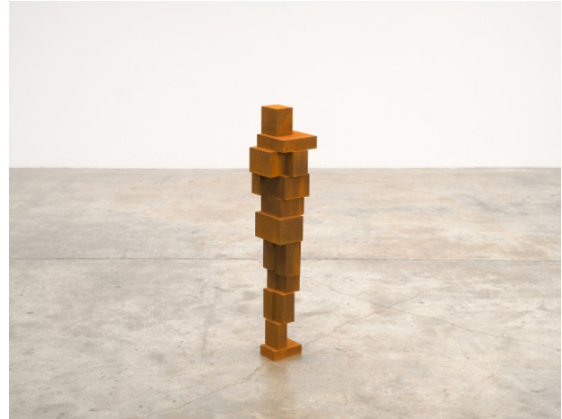
Antony Gormley, Small Still II, (2025). Cast iron. 92.5x18x18cm.