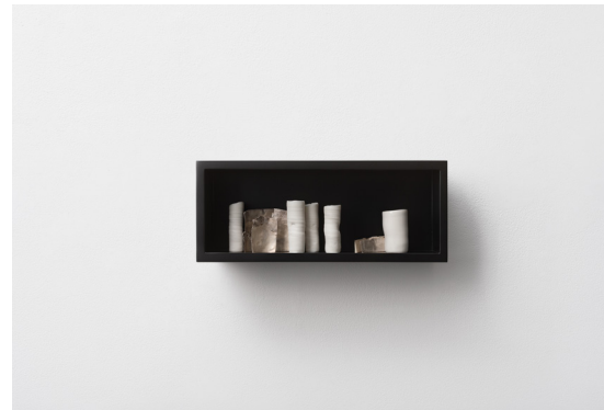
Edmund de Waal, Tristia, I (2025), 5 porcelain vessels and 4 silver tiles in an aluminium and Artglass vitrine, 12.3x30.5x10.2cm. © Edmund de Waal. Courtesy the artist. Photo: Alzbeta Jaresova.