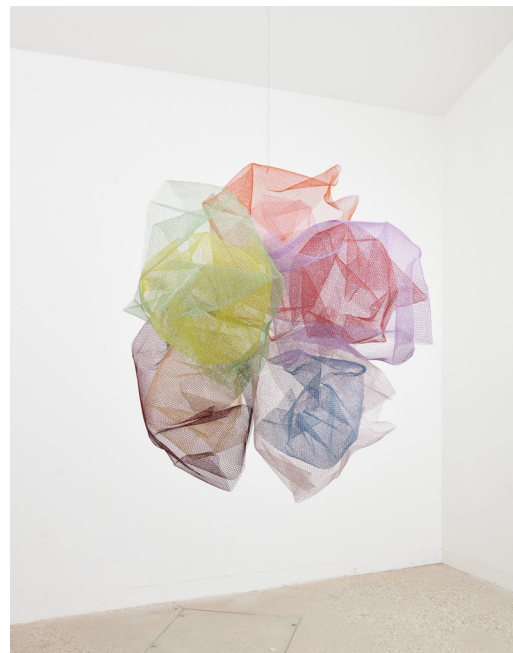
Rana Begum, No.1337 Mesh (2023). Powder-coated galvanised mesh.