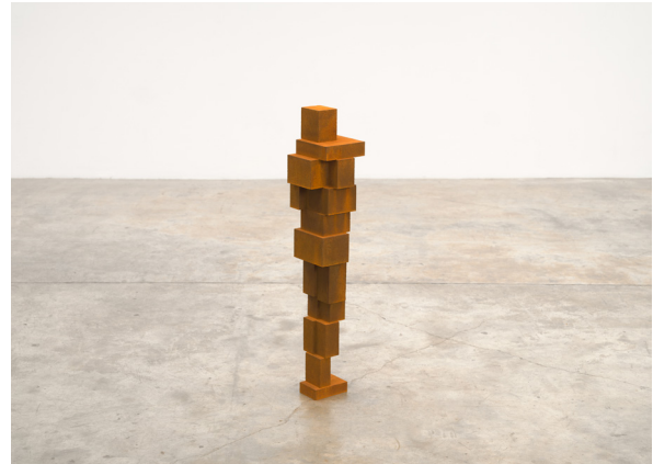
Antony Gormley, Small Still II, (2025). Cast iron. 92.5x18x18cm.