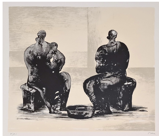
Henry Moore, Two Women Bathing Child II (1973), lithograph printed in colours on T.H. Saunders paper, with full margins. 36.9x42.2cm.