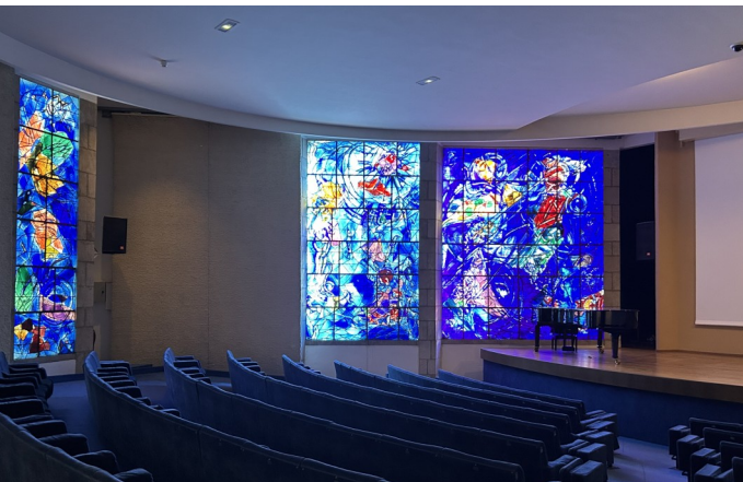
Musée National Marc Chagall

Created in collaboration with the artist, the museum is organised around a set of paintings on Old Testament themes now augmented by additional works to provide the most extensive public collection of art by Marc Chagall in the world. Russian by birth, Chagall lived in Saint-Paul-de-Vence from 1950 until his death in 1985 at the age of 97.