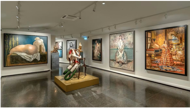
FAMM Museum

The first museum in Europe devoted exclusively to women artists, the FAMM Museum opened in June 2024 to celebrate pioneering and contemporary female voices through painting, sculpture, and installation. Founded by Christian Levett, the museum presents more than 100 works by over 80 artists - from Berthe Morisot, Leonora Carrington, and Frida Kahlo to Louise Bourgeois, Marina