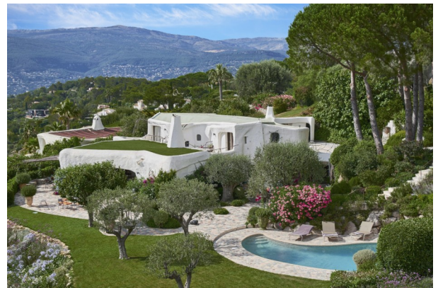
Dragon Hill Residency

A private residence for writers and artists in a stunning setting, Dragon Hill is a unique 1964 'landscape house' (or 'maison sculpture') designed by the French architect Jacques Couelle. Rarely open to the public, the building features organic, Gaudi-esque architecture that blends with the lush 500m 2 gardens and sculpture park overlooking Antibes Bay.