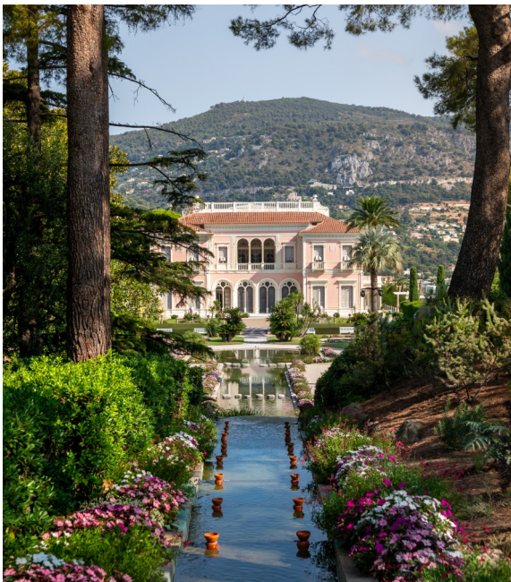
Villa Ephrussi de Rothschild

This spectacular belle époque villa with exotic gardens was created in 1912 as a fantasy world in which to show off Baroness Ephrussi de Rothschild's wonderful, if eccentric, collection of artefacts; it was inspired by a visit