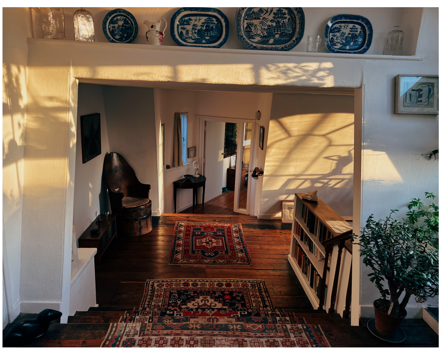
The Kettle's Yard House