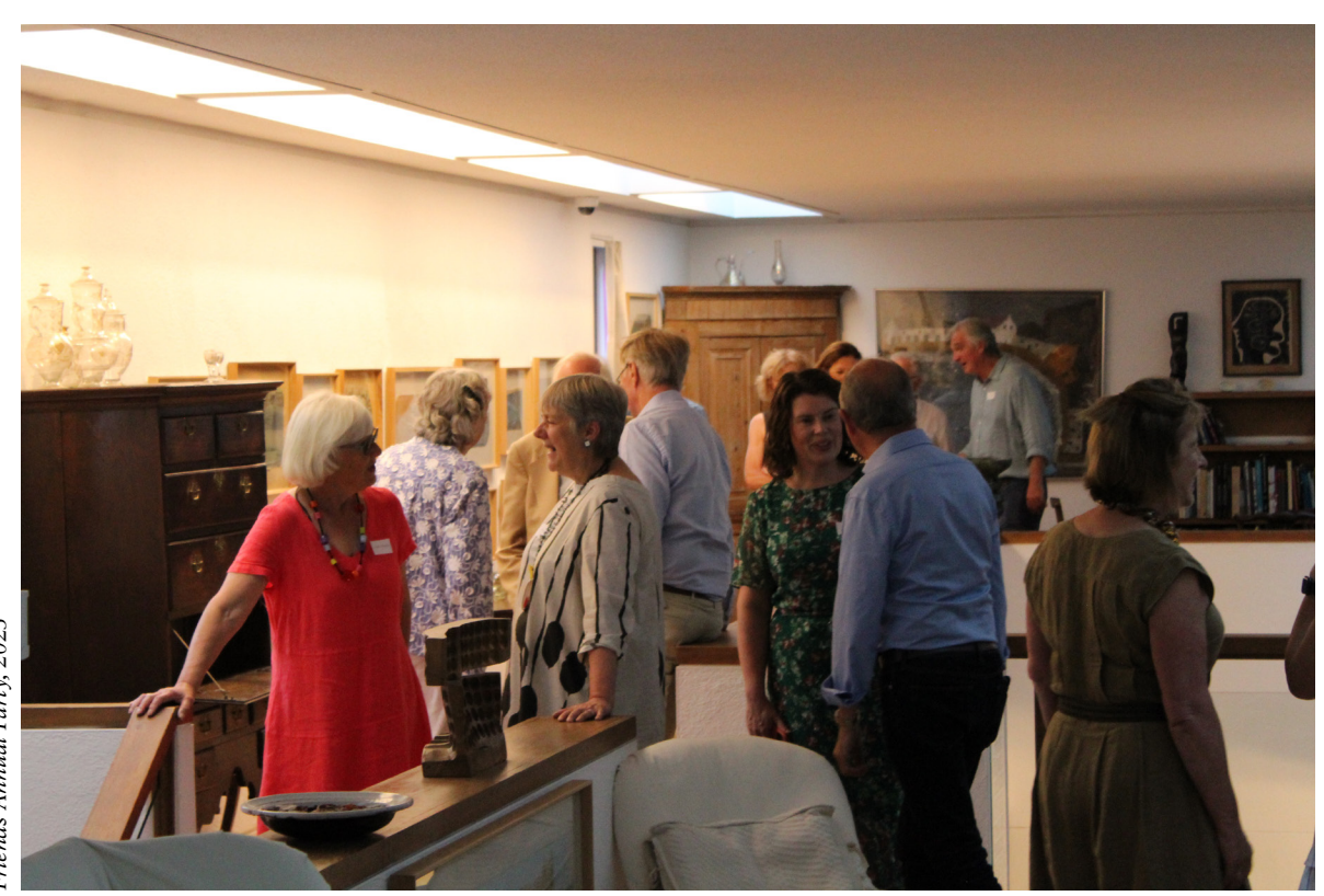
Friends Annual Party, 2023