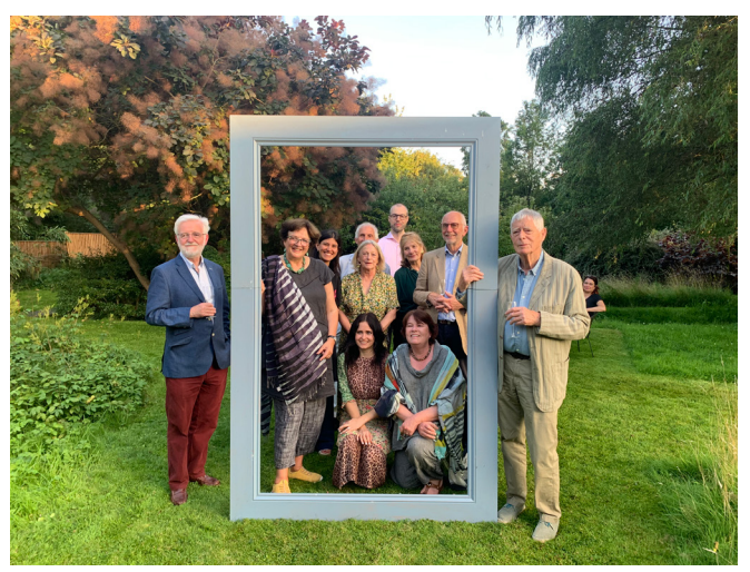
Some of the Friends of Kettle's Yard

The Friends of Kettle's Yard are seeking a new Secretary to join the Friends Committee to help support the smooth running of the Friends.