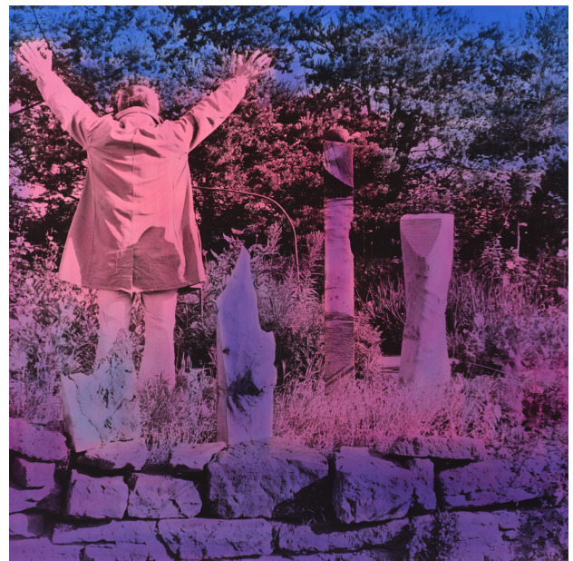
Li Yuan-chia, Untitled , 1994, Unique hand-coloured photographic print.