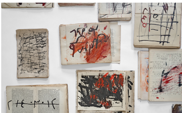
Issam Kourbaj, Urgent archives, written in blood , 2019. Photo: This Is Photography. Courtesy the artist.

'Issam Kourbaj: Urgent Archive' is curated by Amy Tobin and Guy Haywood. A concurrent solo exhibition of work by Issam Kourbaj, 'You are not you and home is not home', will take place at The Heong Gallery, Downing College, Cambridge. A new publication will explore the themes and artworks in both exhibitions.