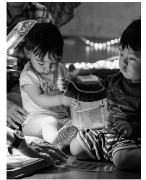
Early Years Studio, 2018.