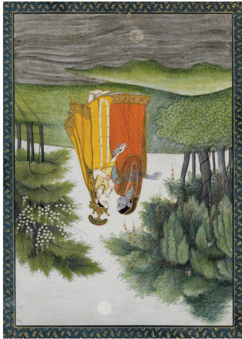
Kangra School, Krishna and Radha walking by the Jamma by moonlight after having exchanged clothes, bodycolour including white, pen and ink with gold, drawn within decorative border, on paper, 17 x 12.4 mm, circa 1820