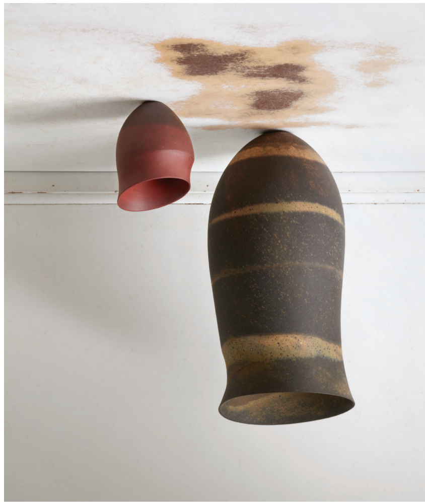
Jennifer Lee, Dark flashed asymmetric, amber bands, titled rim , 1991, 43.2 x 21.2 cm, Shigaraki Red, fractionated red, dark base, titled, 2014, 13.7 x 10 cm.