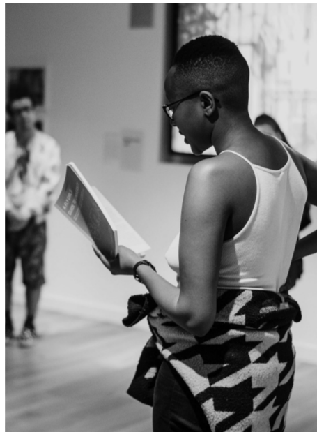
Late at Kettle's Yard, March, 2019.