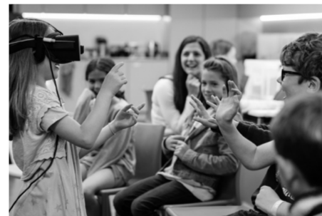
Digital making workshop, 2018.

Artist led workshop for families. FREE, drop-in and have a go