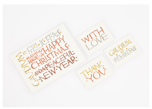
Cambridge Imprint Christmas Cards, From £3.50.

David Jones was born in Brockley, South London, the son of a Welsh printer. He studied at the Camberwell School of Art before the First World War. Three prints available in the shop, Flora in Calix Light , Lourdes and Vexilla Regis reflect his interest in early Christianity, Arthurian myths and the ancient classical world.