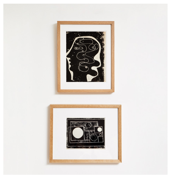
Ben Nicholson, Head, 1933 (top), reproduction print, £17.