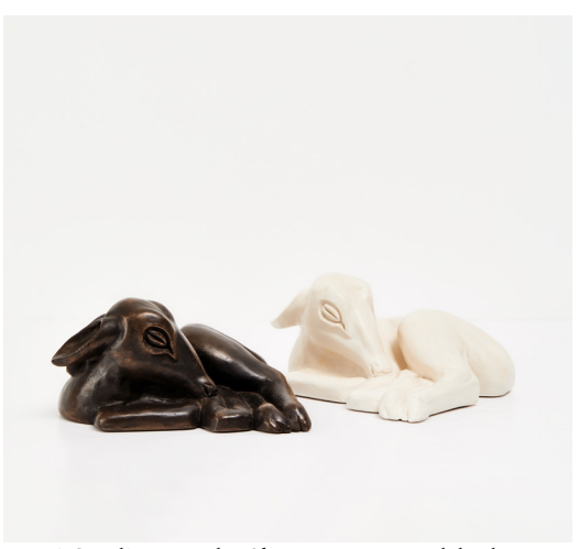
Henri Gaudier-Brzeska Sleeping Fawn model, photo: Beth Davis. £135-£155.