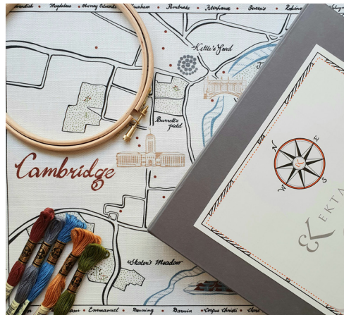
Ekta Kaul Cambridge Embroidery Kit. £65.