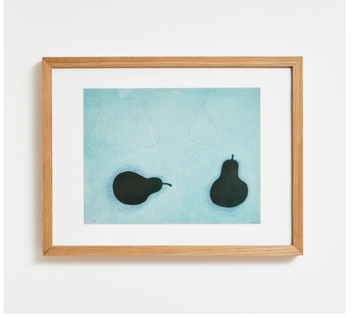
William Scott, Pears, reproduction print, £20