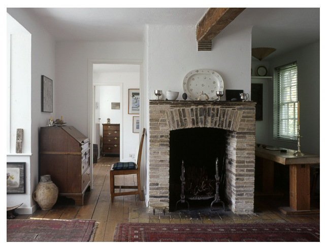
Kettle's Yard house