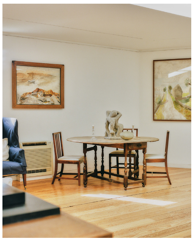
Kettle's Yard house