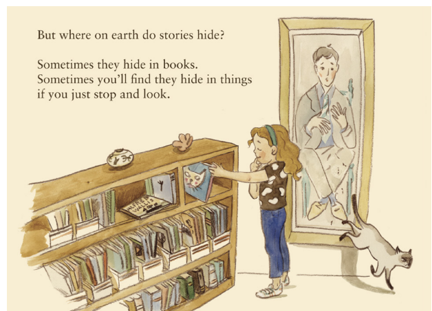
All images: Extract from Finding Our Story , illustrated by Tonka Uzu, text by Imogen Alexander, 2021.