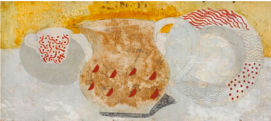
Ben Nicholson, 1930 (plate, cup and jug)