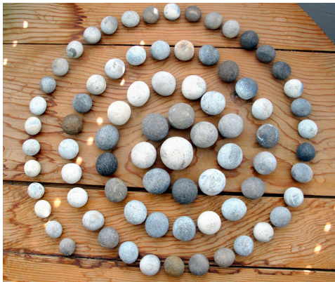
Jim Ede, Spiral of Stones

Jim displayed his collection of pebbles in different ways, organised by size to create a beautiful spiral pattern and in a gradient of colour.