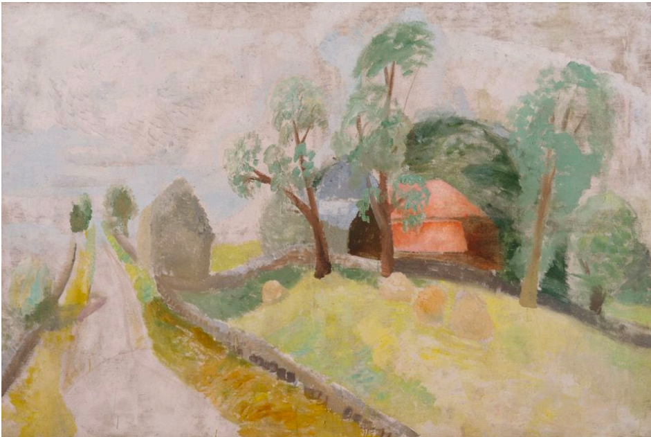
Winifred Nicholson, Road Along a Roman Road, 1926

Starting school is a bit like setting off on a new journey. Look at this painting by Winifred Nicholson. What can you see? If you could jump inside the painting where would you go?