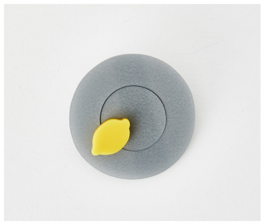
I Am Acrylic Lemon on a Pewter Dish brooch, £15

Join has produced this scented candle exclusively for Kettle's Yard. Inspired by the heady aromas of Jim Ede's homemade pot pourri, it is presented in a handcrafted ceramic dish. The Join range at Kettle's Yard also includes 120ml candles in four other scents; 'High Tide', 'Low Tide', 'Hedgerow' and 'Pebble'. Join luxury soy candles are vegan, poured by hand, 100% natural and scented with essential oils.