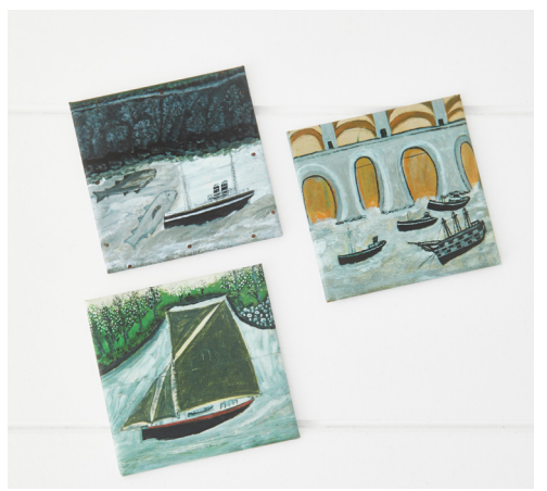
Alfred Wallis Fridge Magnets, £3.50 each

Small UK-based paper-making business Cambridge Imprint has designed a set of luxury Christmas crackers exclusively for Kettle's Yard. The snowflake crackers, come in boxes of 6 and contain luxury prizes including a glass tree ornament with antique sari tie and a star printing block. Also available are A6 snowflake greetings cards which come in sets of 10 with ivory envelopes.