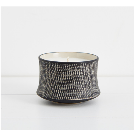
Join natural candle in handcrafted ceramic dish, £36