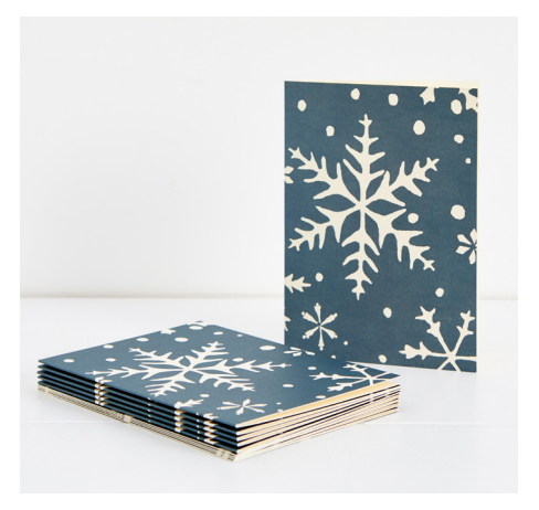
Greetings cards, £12.95