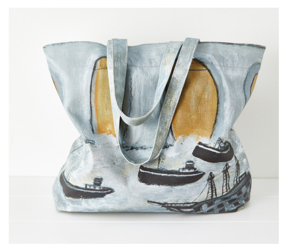
Alfred Wallis tote bag, £29