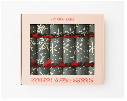
Set of 6 luxury crackers, £39