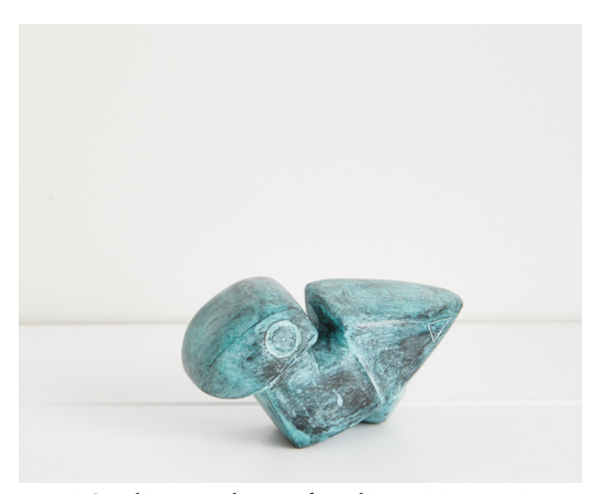
Henri Gaudier-Brzeska Duck replica, 120mm x 65mm x 40mm, £45