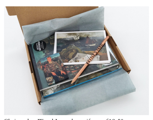
Christopher Wood Letterbox gift set, £19.50