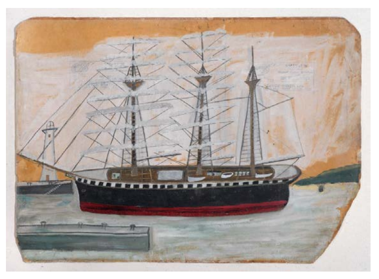
Wallis, Three Masted Ship near Lighthouse, 1928-30

Wallis, Letter to Jim Ede , April 6 1936